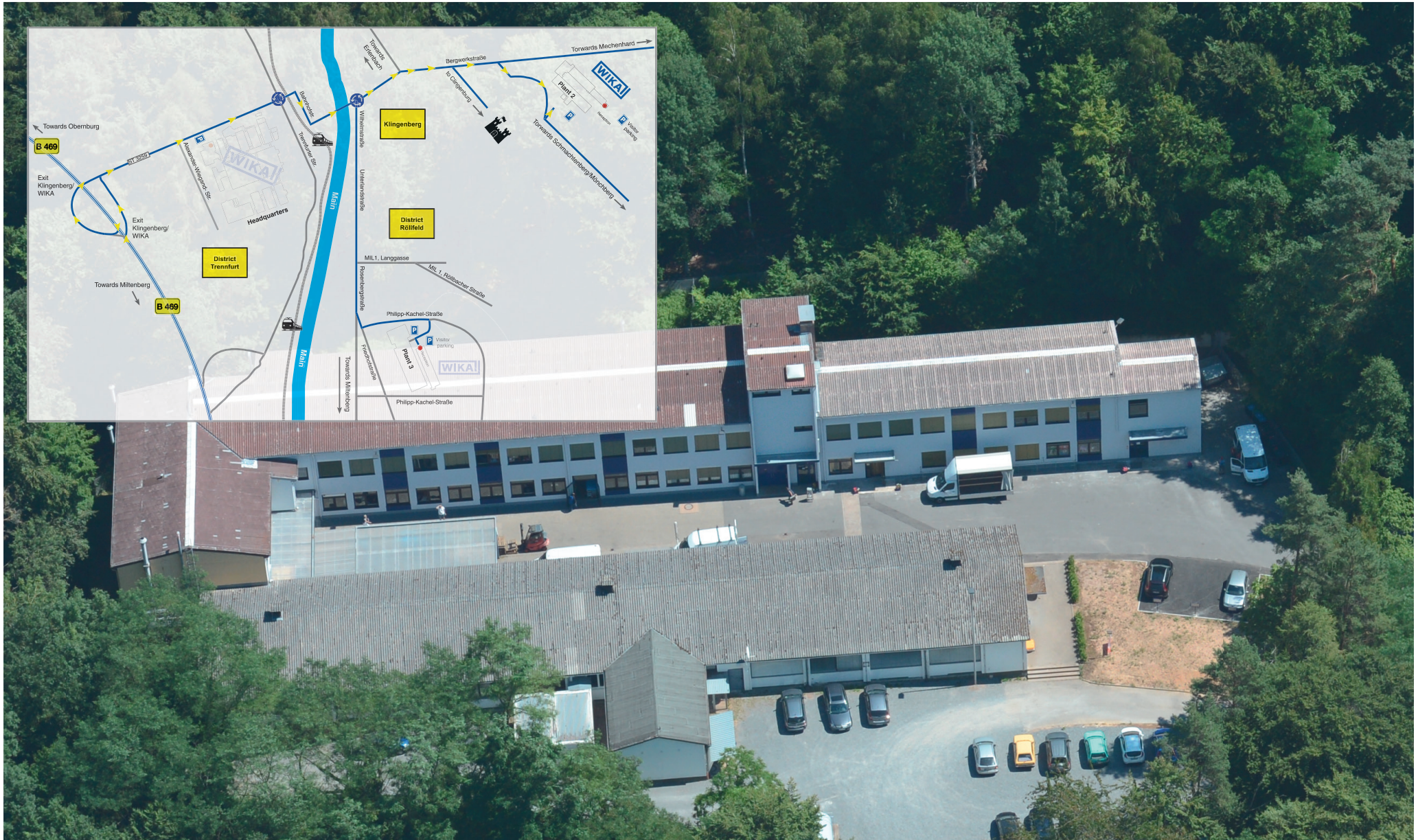
Access routes to plant 2, September 2013