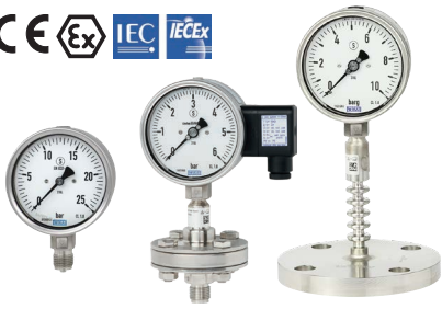
Measuring assemblies with model 910.21